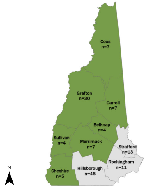
Figure 1. New Hampshire practitioner respondents working in rural (green) and non-rural (grey) counties. This map excludes 19 practitioners who reported working in multiple counties (18 rural, 1 non-rural, 1 unknown).

From October 2020 to March 2021, we surveyed practitioners working across New Hampshire using an online survey. Survey respondents included 152 practitioners, 81 of whom reported working in rural counties (Figure 1). Among practitioner respondents, 71 (42 rural) were in counseling, case management, and recovery coach roles, and 81 (39 rural) were in clinician or pharmacist roles. Among clinicians, 55 (28 rural) were able to prescribe medications (e.g., MD, DO, NP, PA), and 26 (11 rural) were not (e.g., nurses, nursing assistants, medical assistants). Among the 47 prescribing practitioners who answered the question, 28 (15 rural) reported being waived to prescribe buprenorphine, while 19 (9 rural) were not currently waived to prescribe buprenorphine.